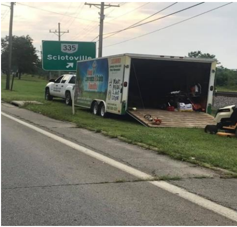
LSSWMD Mowing along US 52 in Sciotoville, Scioto County